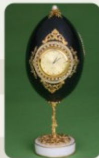
EMU EGG CLOCK Item No. E-5

A real working Emu Egg Clock, which is decorated with rows of pearl chain, golden cord, rhinestone chains and golden filigrees. The heart shaped doors on the back provide access to the clock