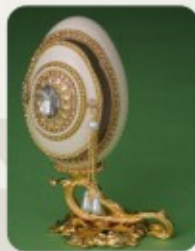
BEJEWELLED ENCHANTER Item No. G-3

The door of this enchanting Goose Egg is decorated with a golden crystal surrounded by gold filigree, pearl string and rhinestone chain. The interior is lined with white satin and a golden tassel is fixed on the door. The egg is