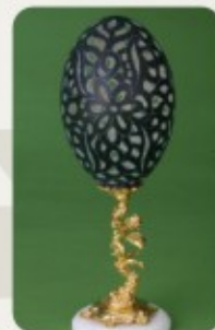
EMU FLOWERS Item No. E-7

Emu egg is completely carved in beautiful floral patterns. The naturally deep green Emu egg is etched meticulously to maintain its original colour while the outlines of the floral patterns reveal the