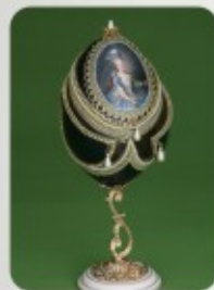
EMU DOUBLE SURPRISE Item No. E-1

Emu Egg is cut to open three doors. The top door is decorated with a satin print. The inside of the egg is lined with brocade. The egg is mounted on a golden stand and placed on a white Corian base.