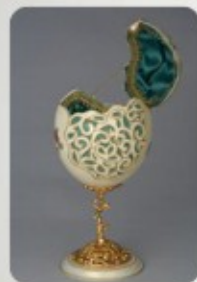
HEAVEN ON EARTH Item No. O-5

This Ostrich egg is beautifully carved and embellished with floral transfers. The interiors are lined with green satin and silk organza. A golden chain is placed on the top to act as a stopper to the lid.