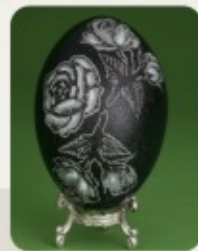
BLACK BEAUTY Item No. E-3

Emu Egg is painstakingly carved to make beautiful roses. The outermost dark green layer of the eggshell is gently etched to make the underlying light bluish-green and whitish layers visible in the rose petals and leaves. The egg is mounted on a silver stand.