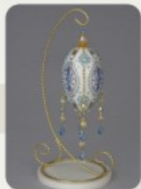
AQUAMARINE CHANDELIER Item No. G-1

Goose egg is intricately cut in a delicate design and coloured crystals are meticulously glued to it using jewellers' cement. Four beaded bangles are attached to the egg with small eyelets. The egg is hung on a beautiful