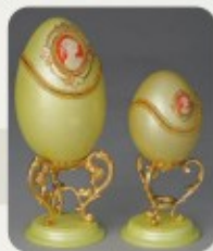
XANTHOUS CAMEOS Item No. F-9

This is a pristine set of xanthous cameos, comprising of Goose and Araucana (smaller) eggs. Both the eggs have similar scallop or Prussian cutting and are decorated on the top with beautiful cameos. The eggs are lined inside with heavy maroon brocade.