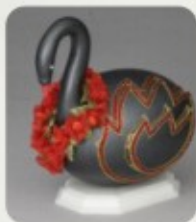
HANSA Item No. F-7

Emu Eggshell is cut to form body of a swan. A Plaster of Paris neck is painted black and affixed on the swan's body. The wings are attached using shell-enlargement technique. The wings are raised using small golden filigree and decorated with red crystals all around.